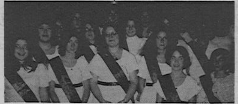
All the Officers of Fidelity Triangle